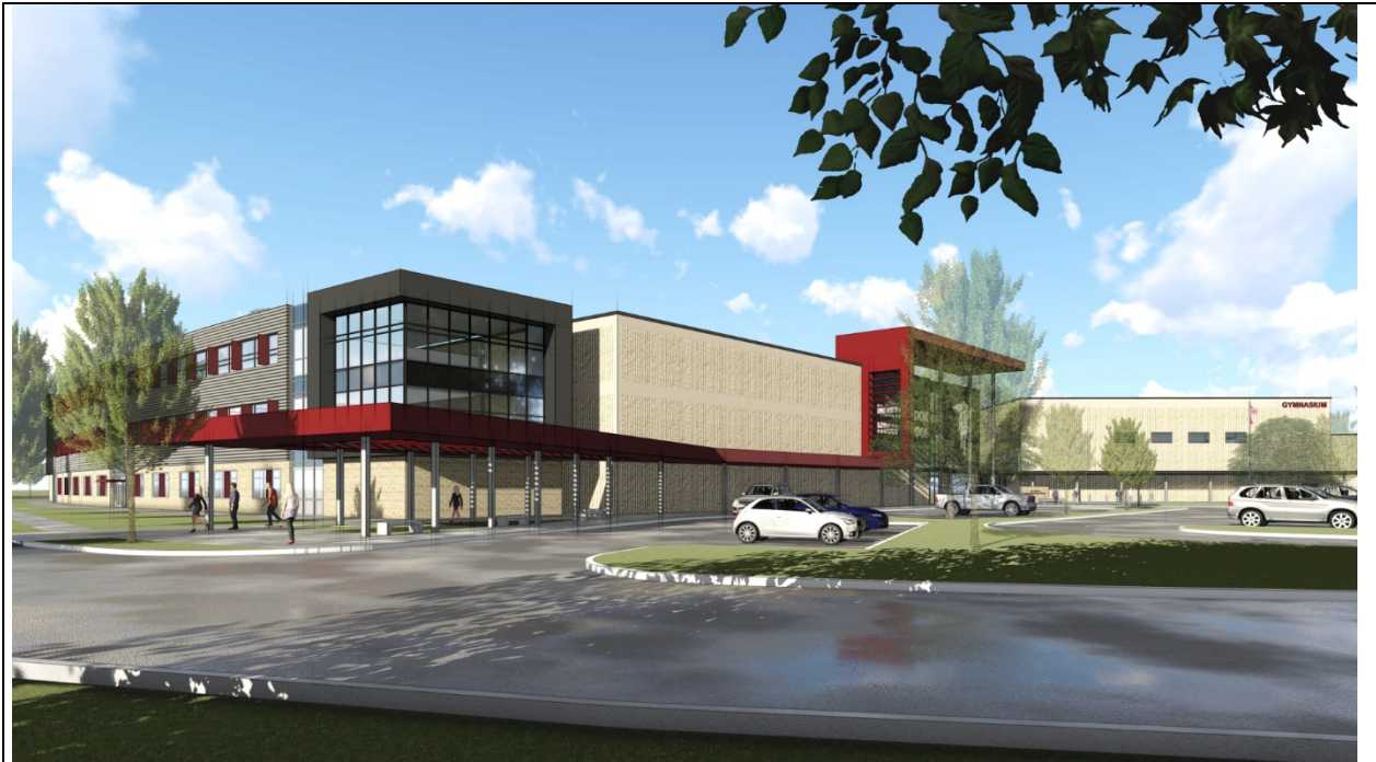
Schematic Design of Front Corner.