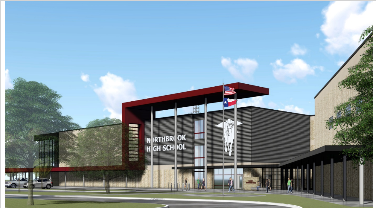
Schematic Design of Main Entry.