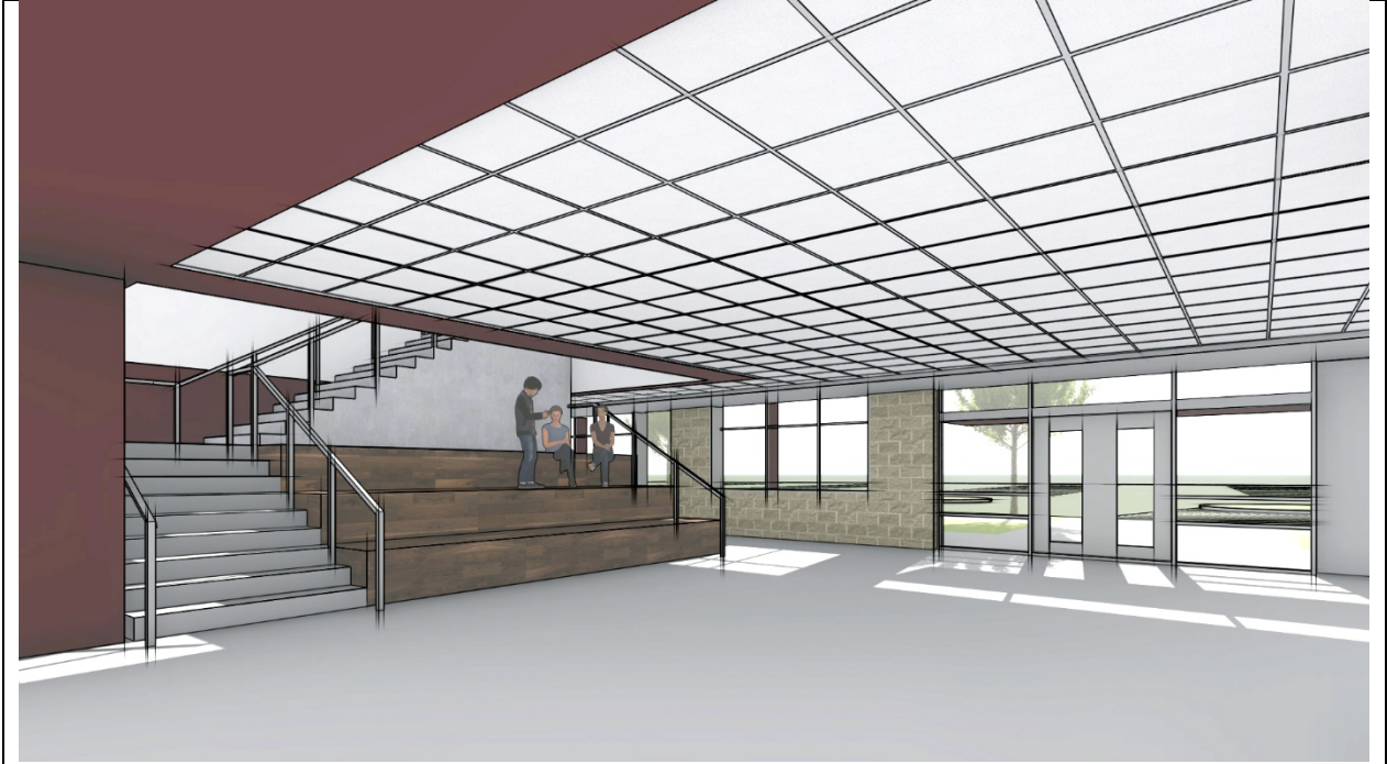
Interior at Stairwell