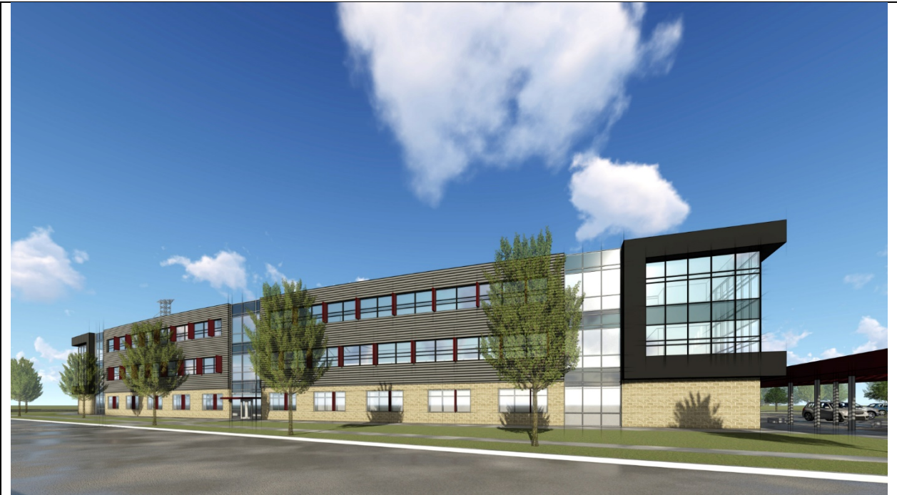
Schematic Design of West Façade.