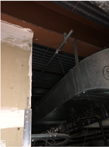
Above ceiling after hour work in progress