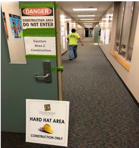
After hours work in progress.