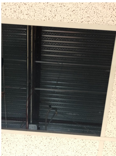
Above ceiling after hours electrical work in progress.