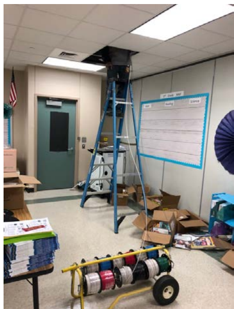
After hours work in progress.