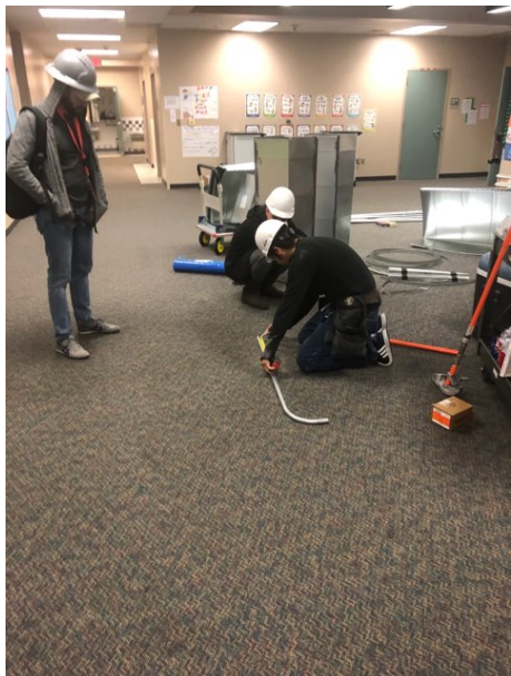
Preparation for electrical above ceiling work