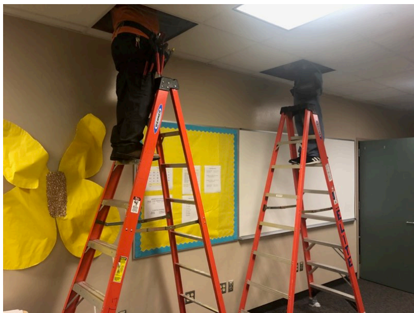
Above ceiling after hours electrical work in progress.