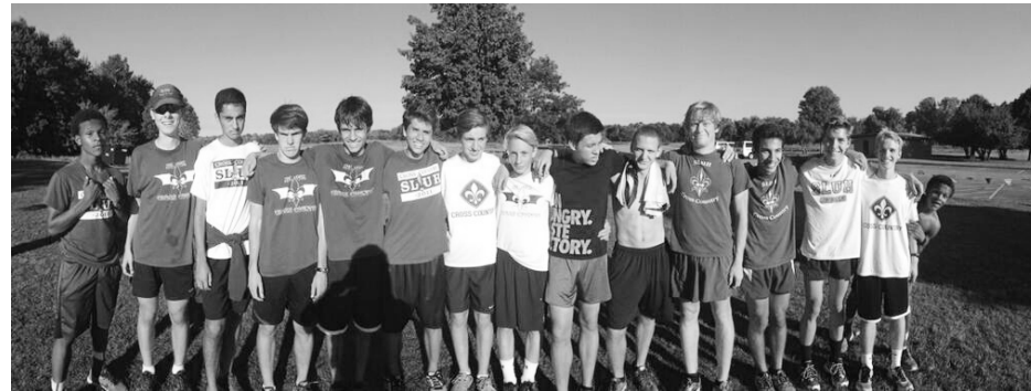
An exhausted varsity cross country team assembled during the Palatine Invitational, where the team placed sixth out of 30 competing teams.

Of the weekend at Palatine, Jackson stated, "The course was so flat. I liked it a lot because the flatness made it easy. The number one team in the nation was in that race and on top of that, Illinois teams just tend to be faster a lot of the time, so it was extremely competitive. Our strategy was just going out fast and not racing scared but instead racing confidently. We got separated a lot during the race. I didn't see any other teammates until after we were done, so that is something we need to work on.