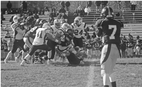
SLUH's defense wraps up Hazelwood Central player in their 23-14 loss last Saturday.