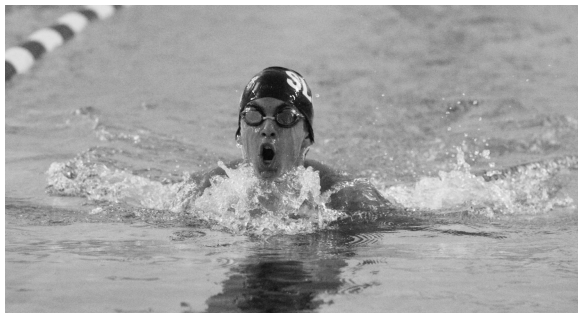
Below: A SLUH swimmer swims the breaststroke in Wednesday's meet at Forest Park Community College.