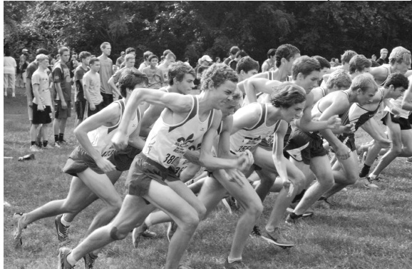
Varsity runners start their first race of the season, the Randy Seagrist Invitational.