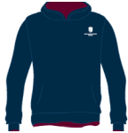
Hoodie , crested