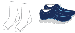
White athletic socks , non-patterned, opaque, and