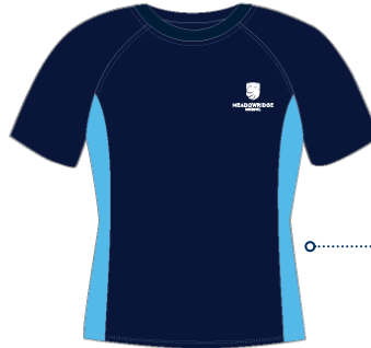
Navy athletic shirt , crested