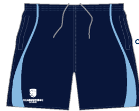
Navy athletic shorts , crested