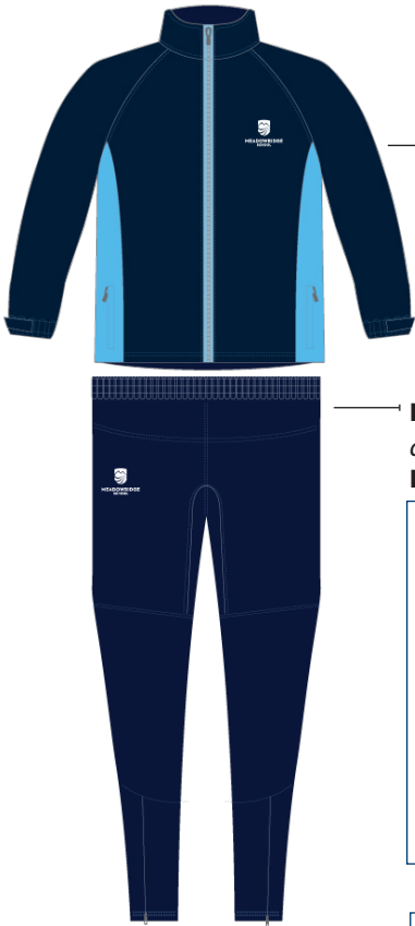
Navy tracksuit jacket, crested