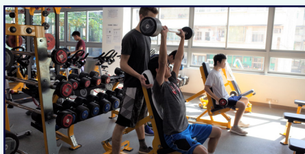
TIGER HEALTH & WELLNESS CENTER

500 students and faculty use this state-of-the-art strength and fitness center each day, with full-time trainers at hand.