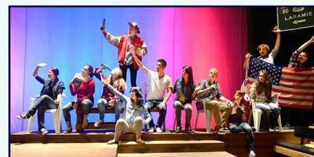
KEVIN B. HELD BLACK BOX THEATER

One of three theaters on campus, the Kevin B. Held Black Box Theater provides an intimate performance space.