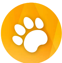
TIGER 2: PAWS