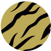
TIGER 1: STRIPES