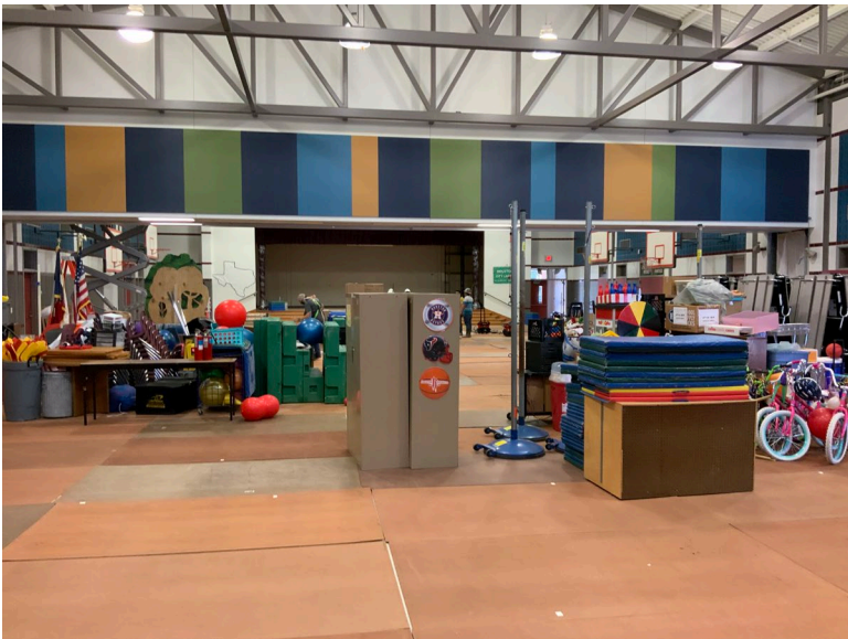
Installing Acoustical Panels in Cafeteria