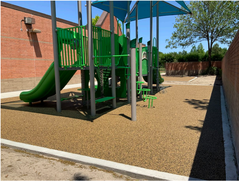
Fall Protection Surface installed at Playground