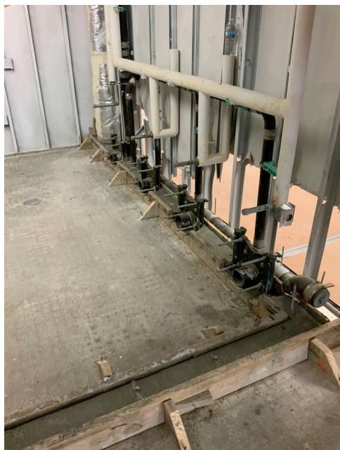
Pouring concrete curbs at restrooms