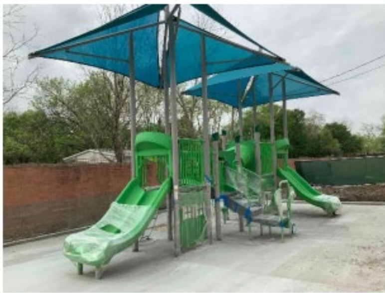
Installation of equipment and concrete poured at playgrounds