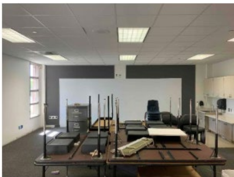
Completing Mock-up Wall in Classroom