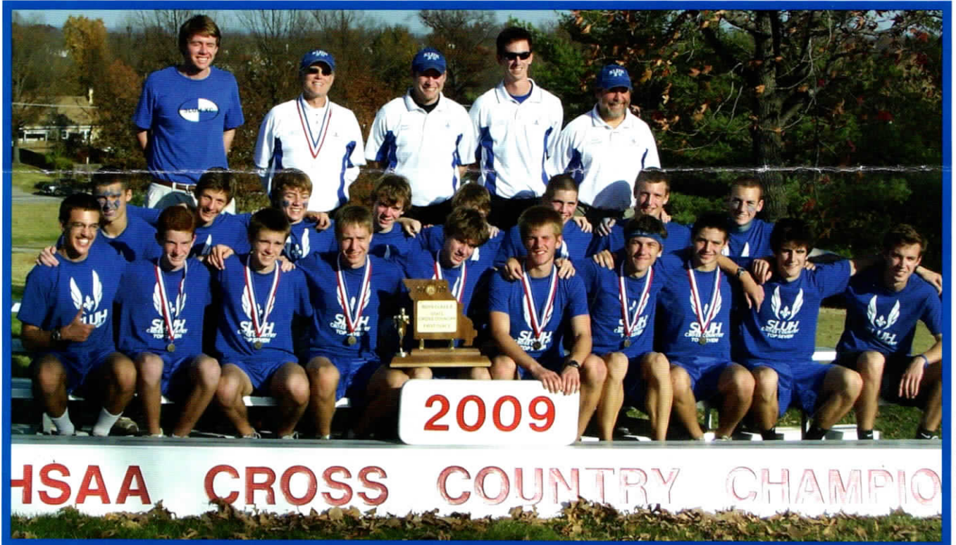
The 2009 State Champion Jr. Billiken Cross Country team

Second State Title in 3 years for XC Runners