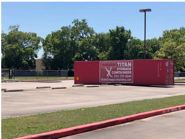
Material storage laydown area.