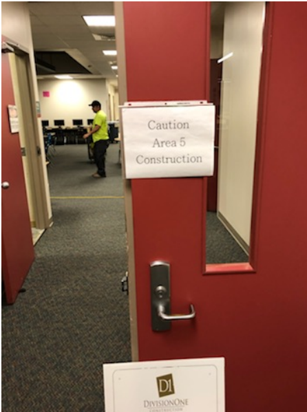
After-hour staging ongoing