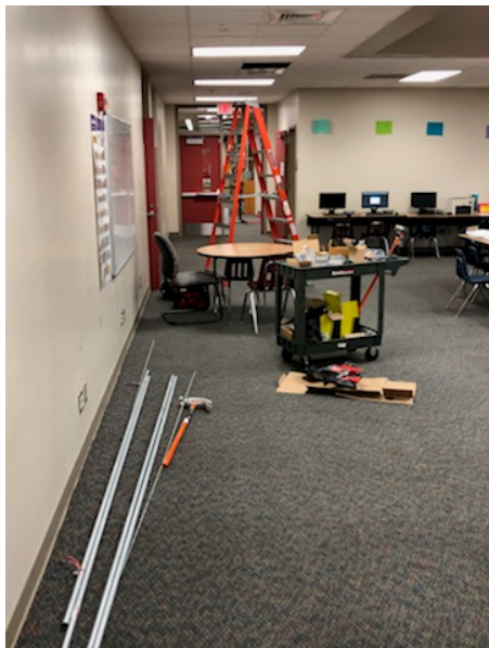
Electrical above ceiling work