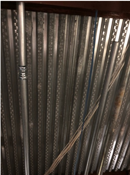
Installing above ceiling conduits.