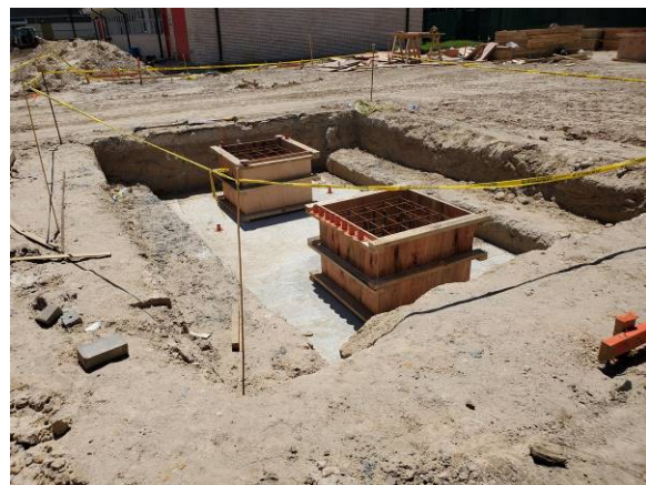
Main building spread footings