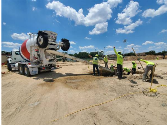
Pouring spread footings on Main Building