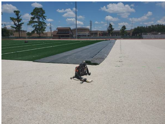
Turf field being installed