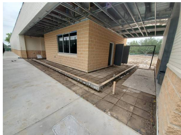
Tennis building coach's office