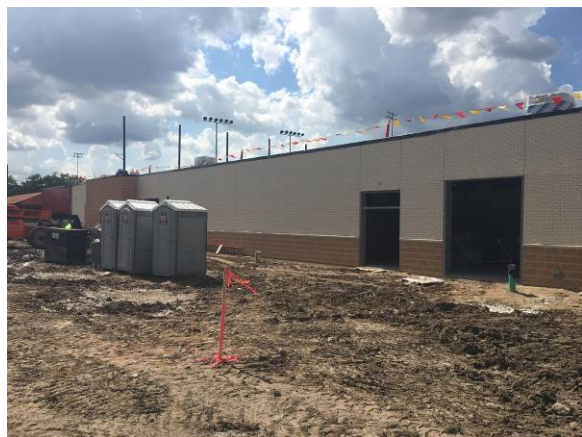
Tennis building masonry and site work