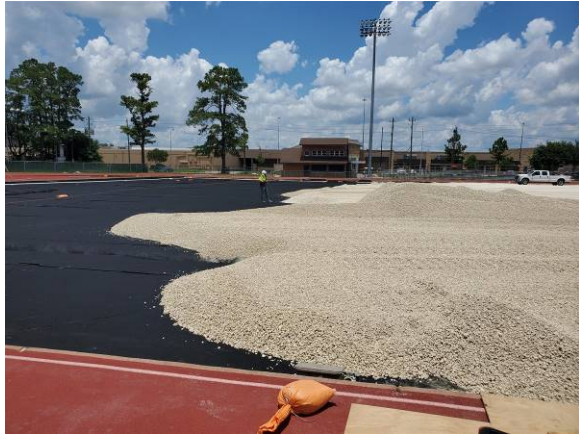
Turf Field rock over drainage fabric