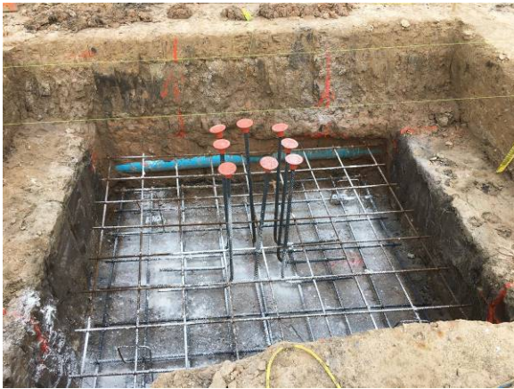
Main building spread footings