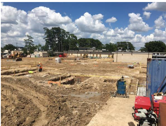
Main building foundation pad