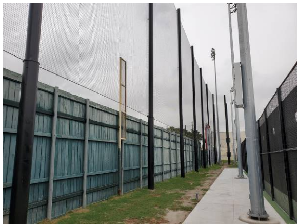
Netting between baseball and tennis