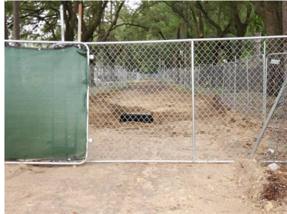
Strom connection and tree protection