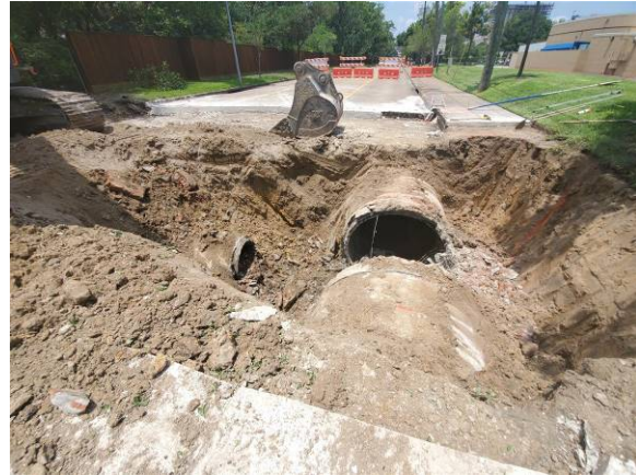
Large storm connection on Gaylord Road