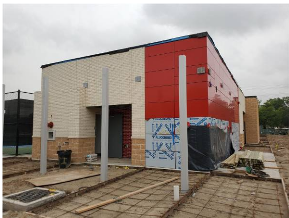
Tennis building canopy columns