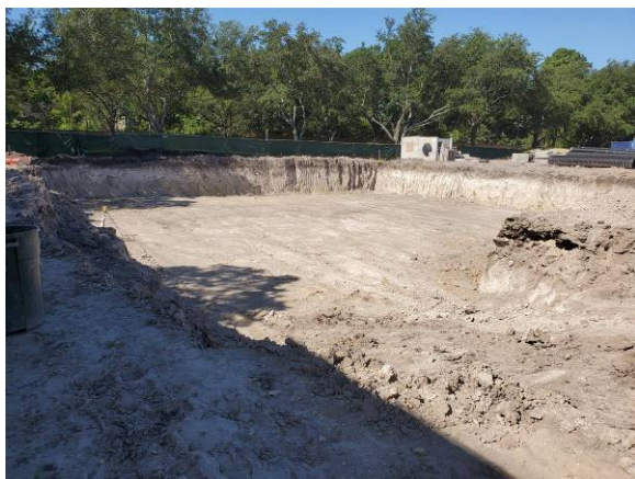
Large underground detention on East Campus