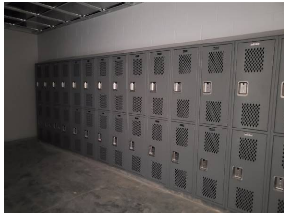
Tennis player's lockers