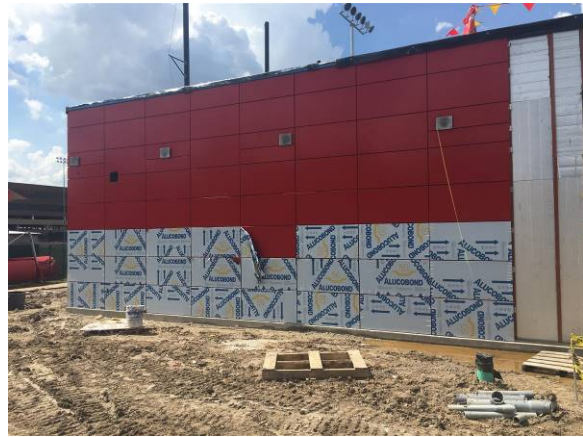
Tennis building metal panel