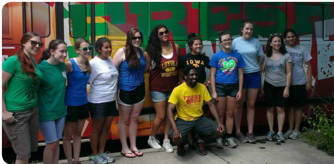
Students from Sacred Heart schools across the country pose in front the Fresh Moves food market bus during Josephinum Academy's first Summer Service Project, hosted June 24-29