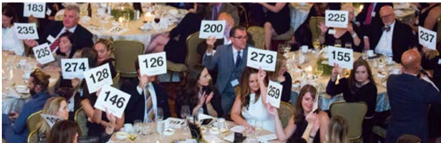
Fundraising paddle raise at the Scholarship Gala