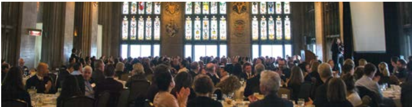
Cathedral Hall at Chicago's University Club, site of the Winter Breakfast