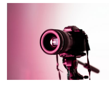
Make-Up School Picture Day

Students will be dismissed from school immediately following their exam. Dismissal will take place between Noon and 1:40pm, depending on the length of the exam.