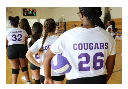
Cheer on our volleyball teams as they play their next games against: