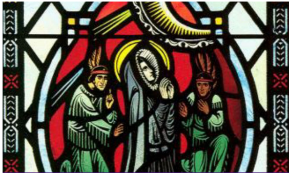
Feast of St. Philippine Duchesne Mass Monday, November 18 10:20 a.m. St. Aloysius Catholic Church

Refreshments will be available. Please enter through the Bell Street lobby.