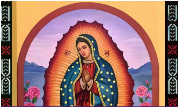
Our Lady of Guadalupe Mass Thursday, December 12, 10:20 a.m. St. Aloysius Catholic Church

Mention Josephinum at the cash register for 15% of your sales to be donated to our school.