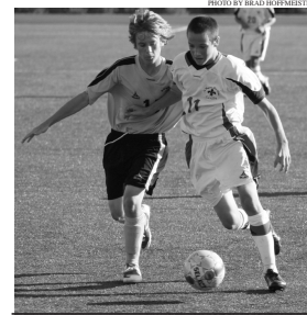
The Jr. Bills have drilled their way to four wins.

Up next for the Ronaldobills is a big game on Oct. 13 at Vianney at 4 p.m.