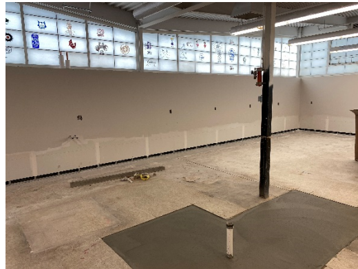
High School – Gym Floor Installation