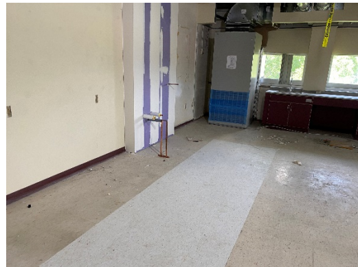
Middle School – Ceiling and Soffits in Corridors