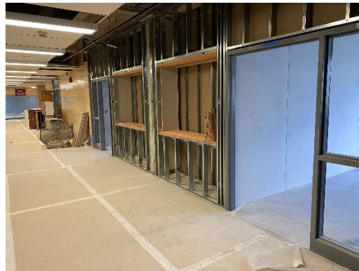
Middle School – Classroom Carpet Installation on Third Level