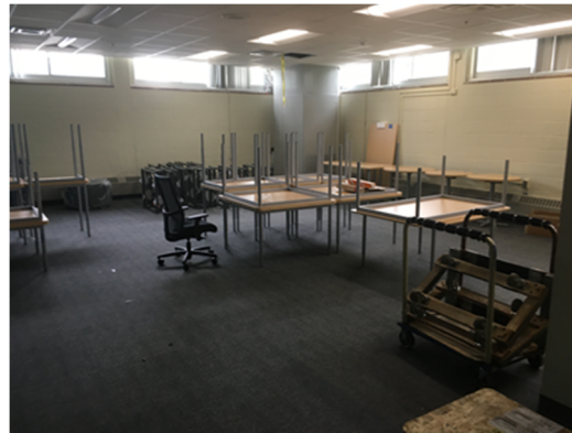
STEM – Kindergarten Rooms Furniture Installed