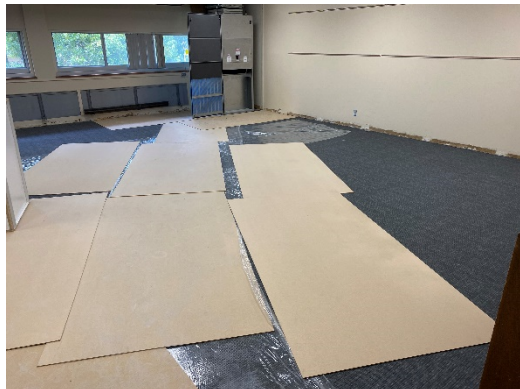
Middle School – Special Education Suite HVAC Ductwork Insulation