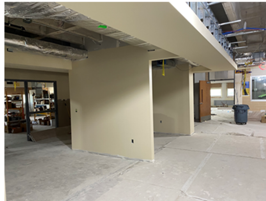
Middle School – Casework delivered and science rooms plumbing chases