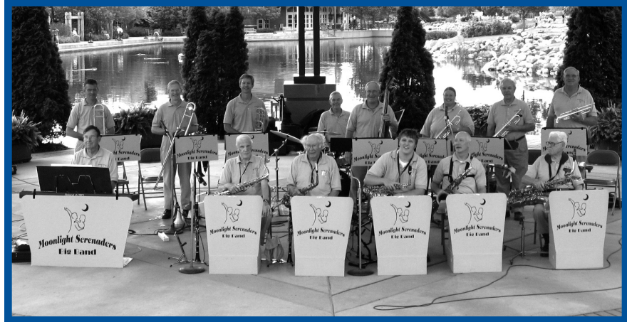
The Moonlight Serenaders will perform Tuesday, April 7th at the St. Anthony Village High School Auditorium.

Tickets are $5.00 before April 6 and $6.00 at the door on April 7.