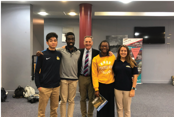
Kathleen Bowin Middle School Principal