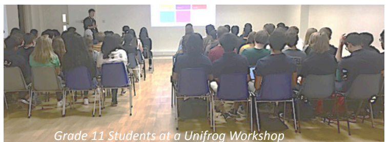
Grade 11 Students at a Unifrog Workshop

These are fairly new platforms that have been introduced within the school community and many of you will have already attended training sessions on how to use them. The parent access code for Unifrog is ABAOmanParents.