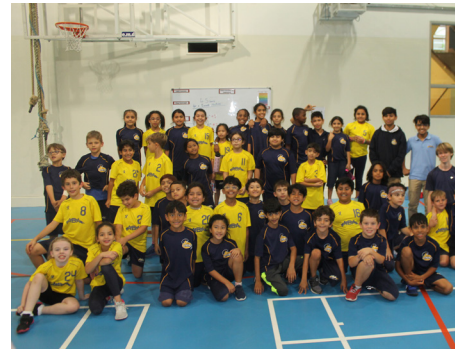
Pictured above: Elementary Benchball team.