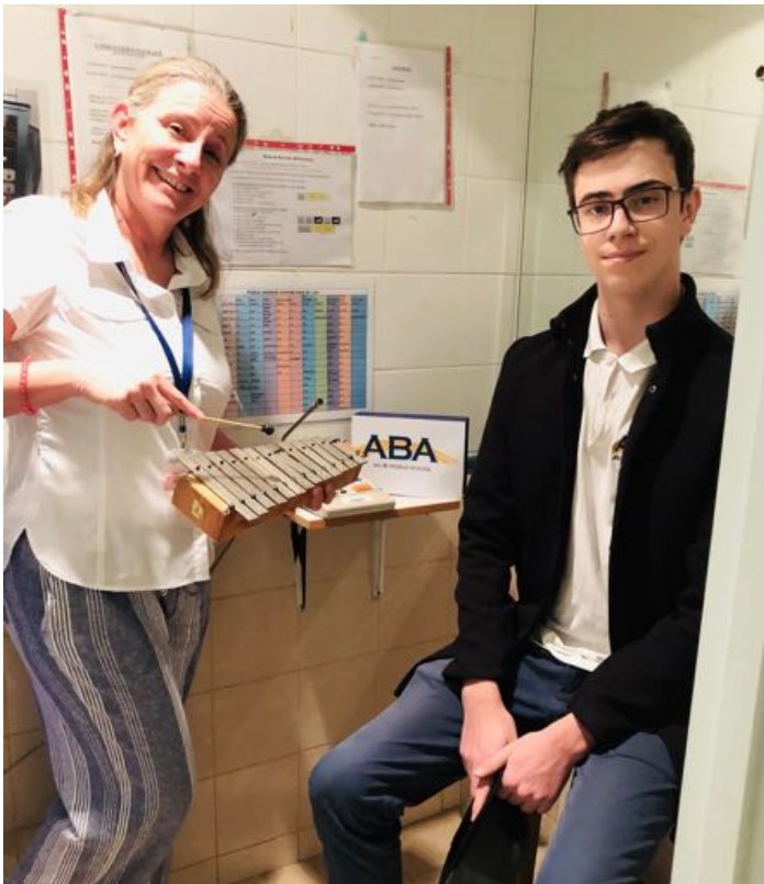
Ms. Kathleen with one of the Language Week announcers who shared clean habit tips in many languages.