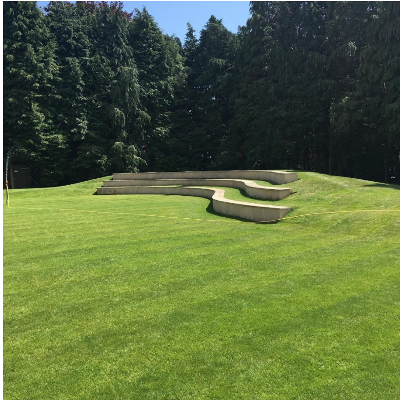
View of the Library Gardens from the entrance