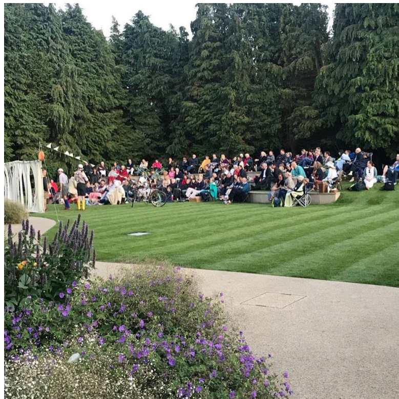
The Library Gardens with audience (not with social distancing)