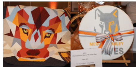
Wolf-themed silent auction items