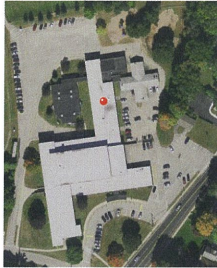
Killingly Central School, 60 Soap Street, Killingly, CT