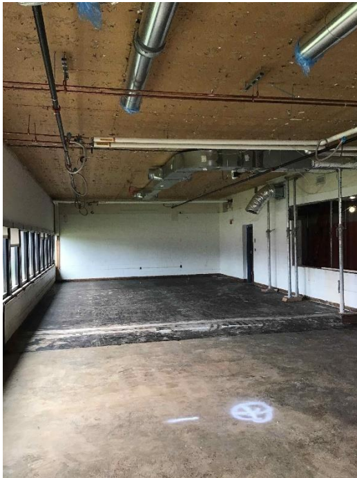
SFMS – Mechanical rough in complete in lower C & D classrooms