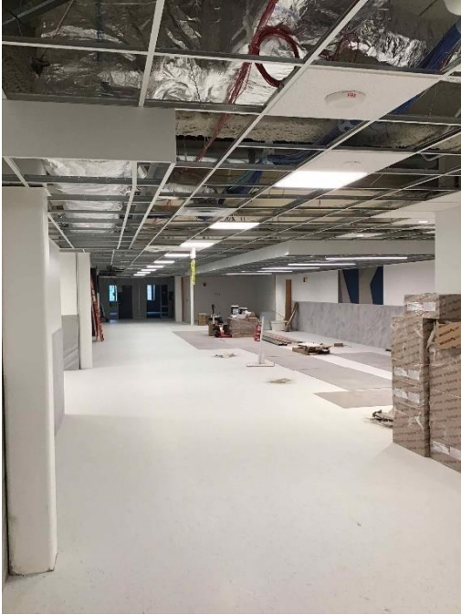
SFHS – Tile complete in upper area K