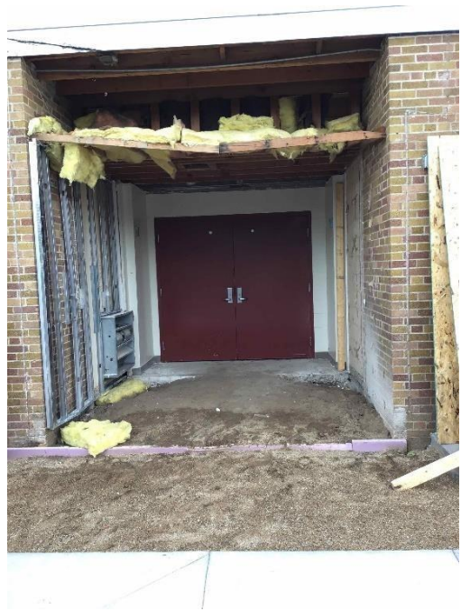
ECFC – Begin construction of North vestibule