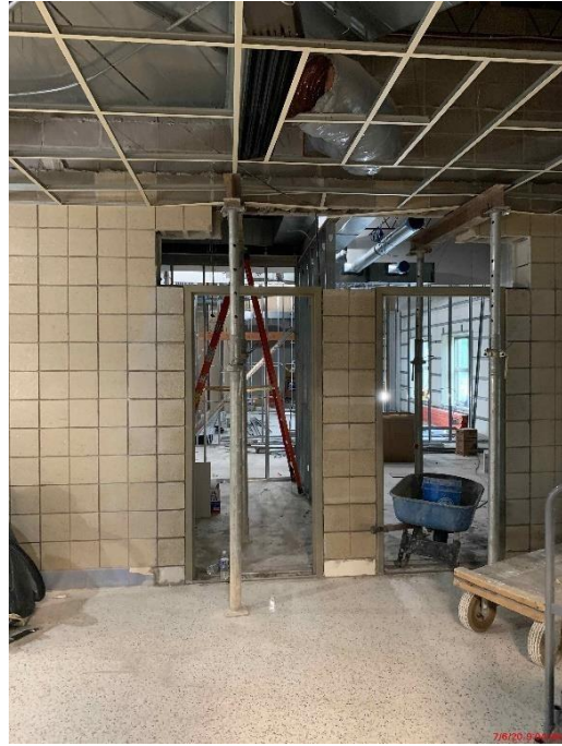
CCES – new steel lintels being installed in area C