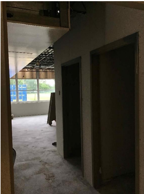
ECFC – Drywall and door frames installed in area B classrooms