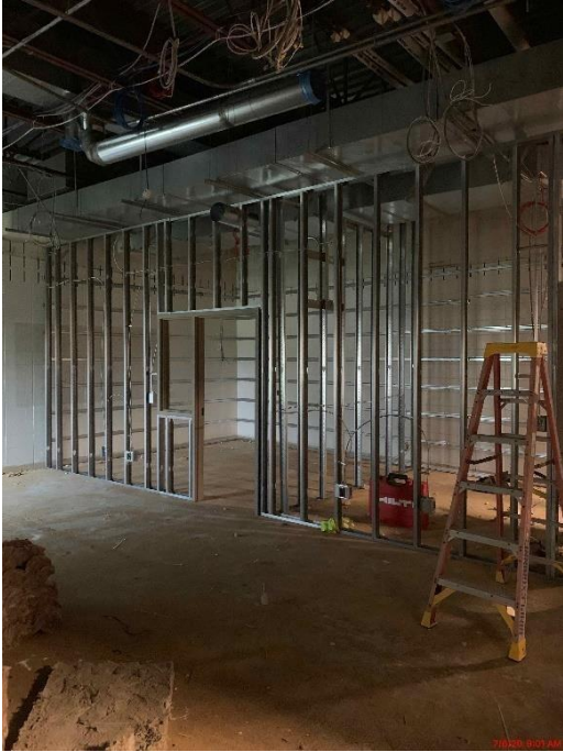
CCES – steel framing complete in area E classrooms