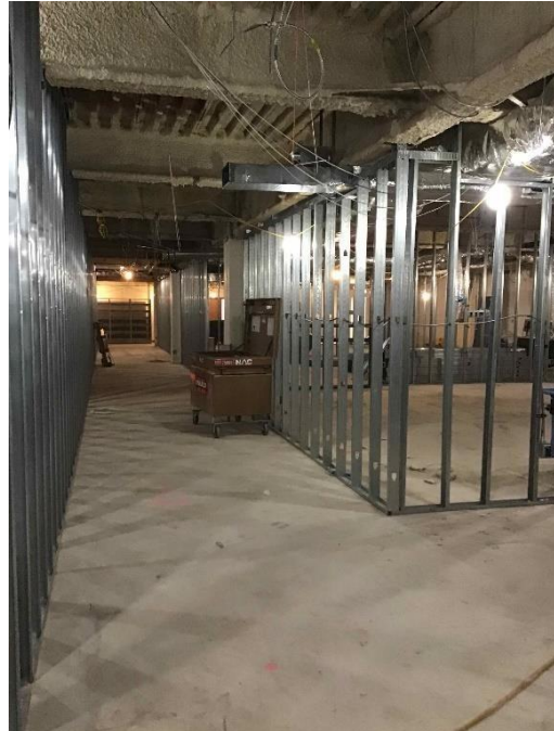
SFHS – Steel framing complete in lower J