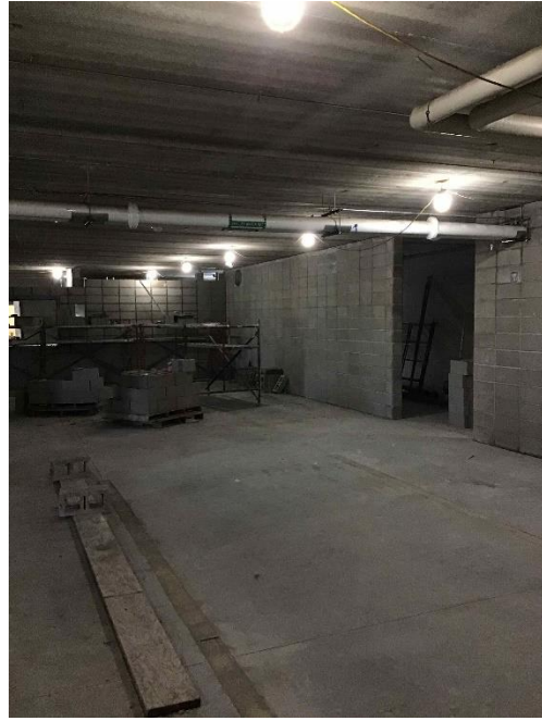
SFHS – CMU walls being built in area A locker rooms