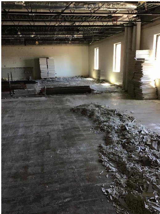
SFMS – Flooring being removed in upper C & D classrooms