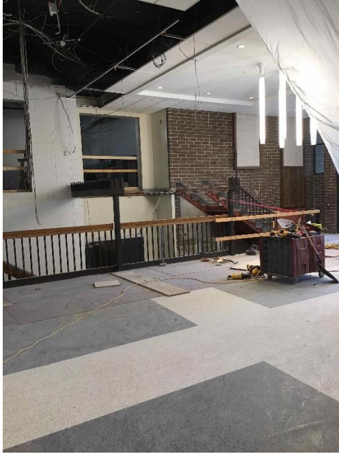
SFHS – Beginning work on removal of old stairwell in area G