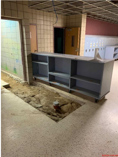
CCES – Underground plumbing ready for concrete in new Kids Connection room