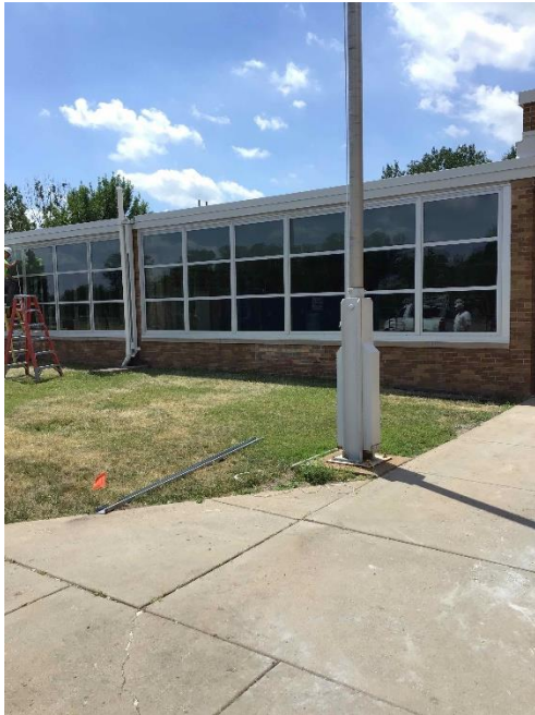
ECFC – New windows on East side of building Area A/B