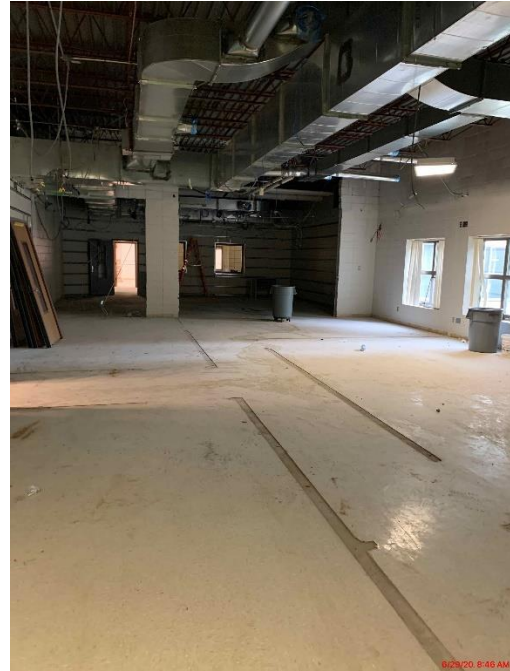
CCES – Walls of old classrooms removed to create new Kids Connection space