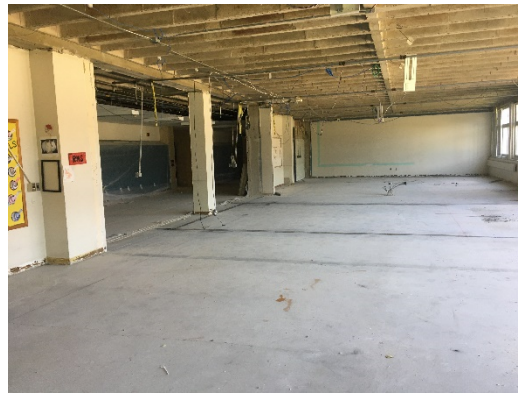
Middle School – Media Center