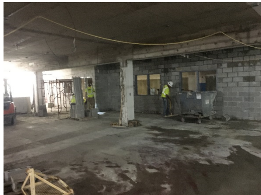
High School – Science Classrooms