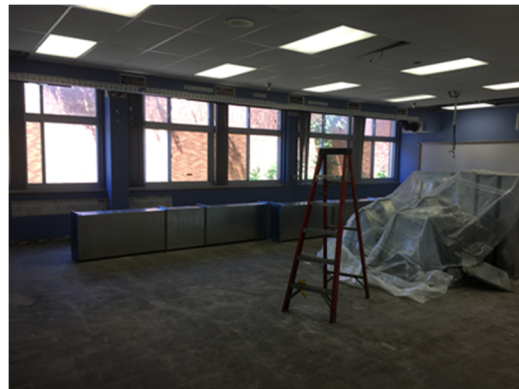
STEM – Pre - Kindergarten Classroom