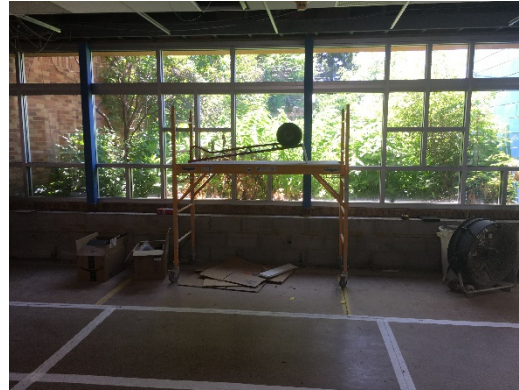
STEM – Kindergarten Classrooms