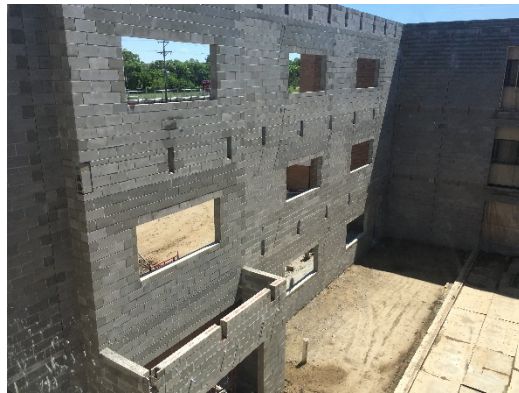
High School – Lower Level Locker Rooms