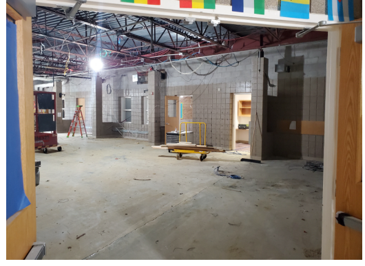
Sheridan Hills – Demolition progress in the existing Nurse Area and Classrooms.