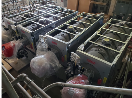
High School – Area P Link