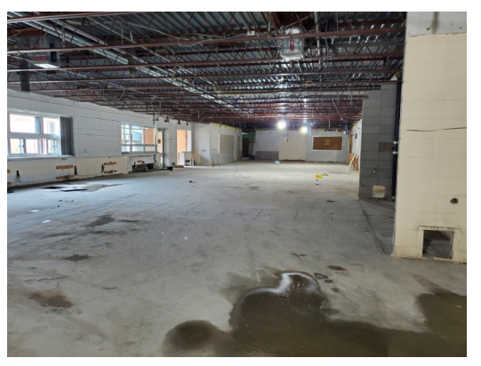
Centennial – Demolition near the existing Lounge area and Music Room.