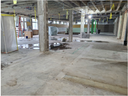
STEM – Kindergarten Classrooms