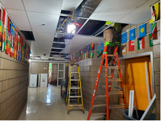
Sheridan Hills - Demolition progress in the existing Media Center/future Admin. Office.