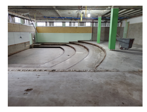
STEM - Music Suite