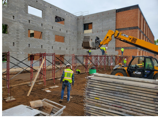
High School – Lower Level F Demolition