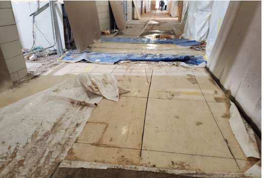
Centennial – Demolition progress in the future Media Center Area.