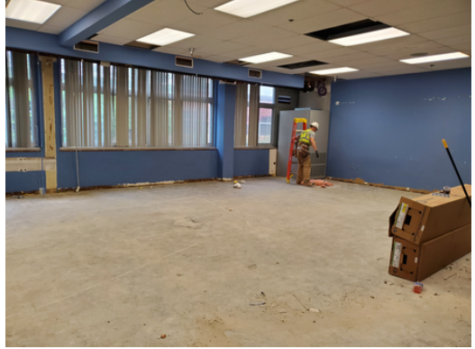
STEM – Pre-Kindergarten Classroom