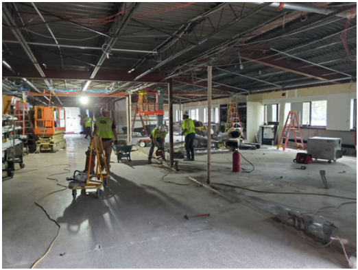
High School-Old Board Room