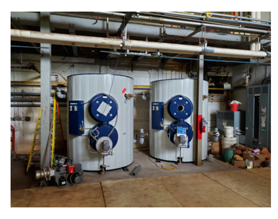
High School – Boiler Room