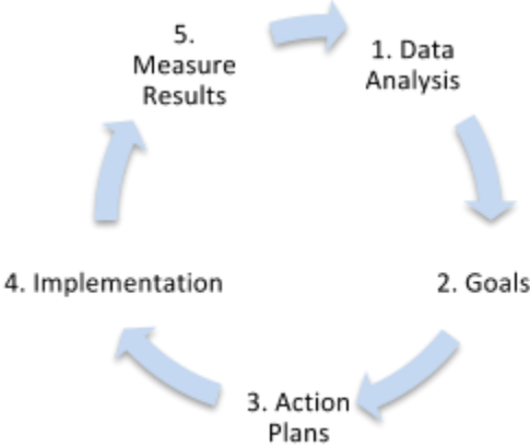
Figure 2: District 197 Continuous Improvement Model

Every teacher in the district must participate as a member of a Collaborative Team (CT). As part of the district, site, and team goal-setting and action-planning process, staff examine strategies for improving instruction, taking into account and selecting best practices.