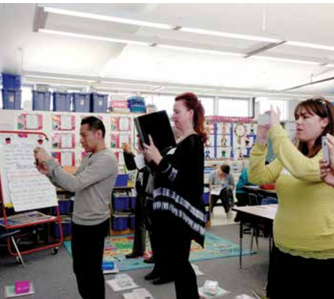
Cotsen fellows taking photos of our student learning walls.

Weaver teachers have opened their classroom doors to nearly 300 visitors this year. Fellow teachers and administrators from throughout California have come to Weaver to learn about our best practices. The Cotsen Foundation for the Art of Teaching organizes teacher visitations in the area of Cognitively Guided Instruction (CGI), Guided Reading, Language Walls, Literature Studies, and Inquiry based Science. Weaver teachers have graciously welcomed colleagues to visit, watch, and learn.