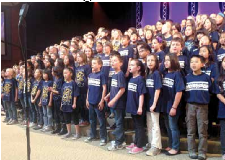
All District Elementary Choir