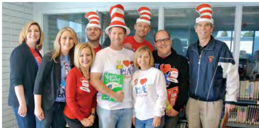
Los Al staff celebrating Read Across Hopkinson