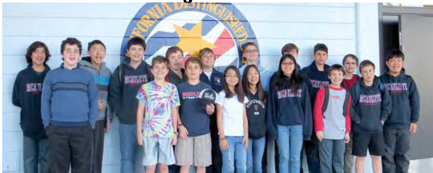
Science Olympiad students.