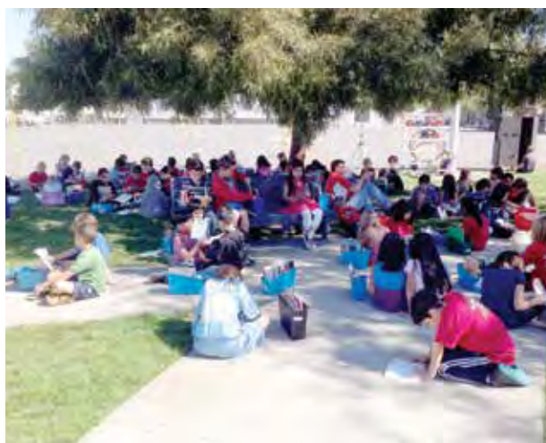
Lee 2nd graders read under the trees.

the reading process in infancy, surrounding your child with a reading-rich environment, talking with your child to enhance vocabulary and language