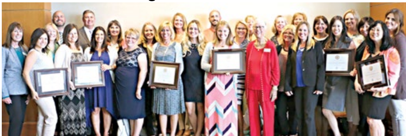
Representatives from all six of our elementary schools being recognized as Gold Ribbon Schools at County celebration.

Our motto is Igniting Unlimited Possibilities in Academics, Athletics, Activities, and the Arts. To dream this big and prepare students to achieve their goals following graduation, we have to have a continued quest for excellence and ongoing improvement.