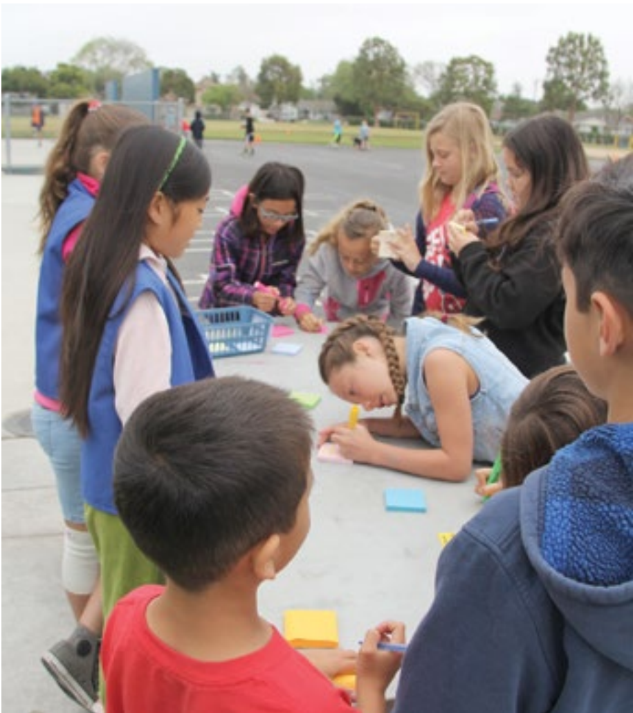
Hopkinson students writing positive notes