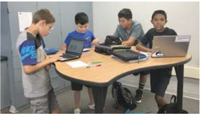
We are very excited about our new furniture allowing for alternative learning environments for students.

Students are loving the opportunity to learn in classrooms that offer a different approach to traditional seating. Oak Lions are off to a great start. Hear us roar!