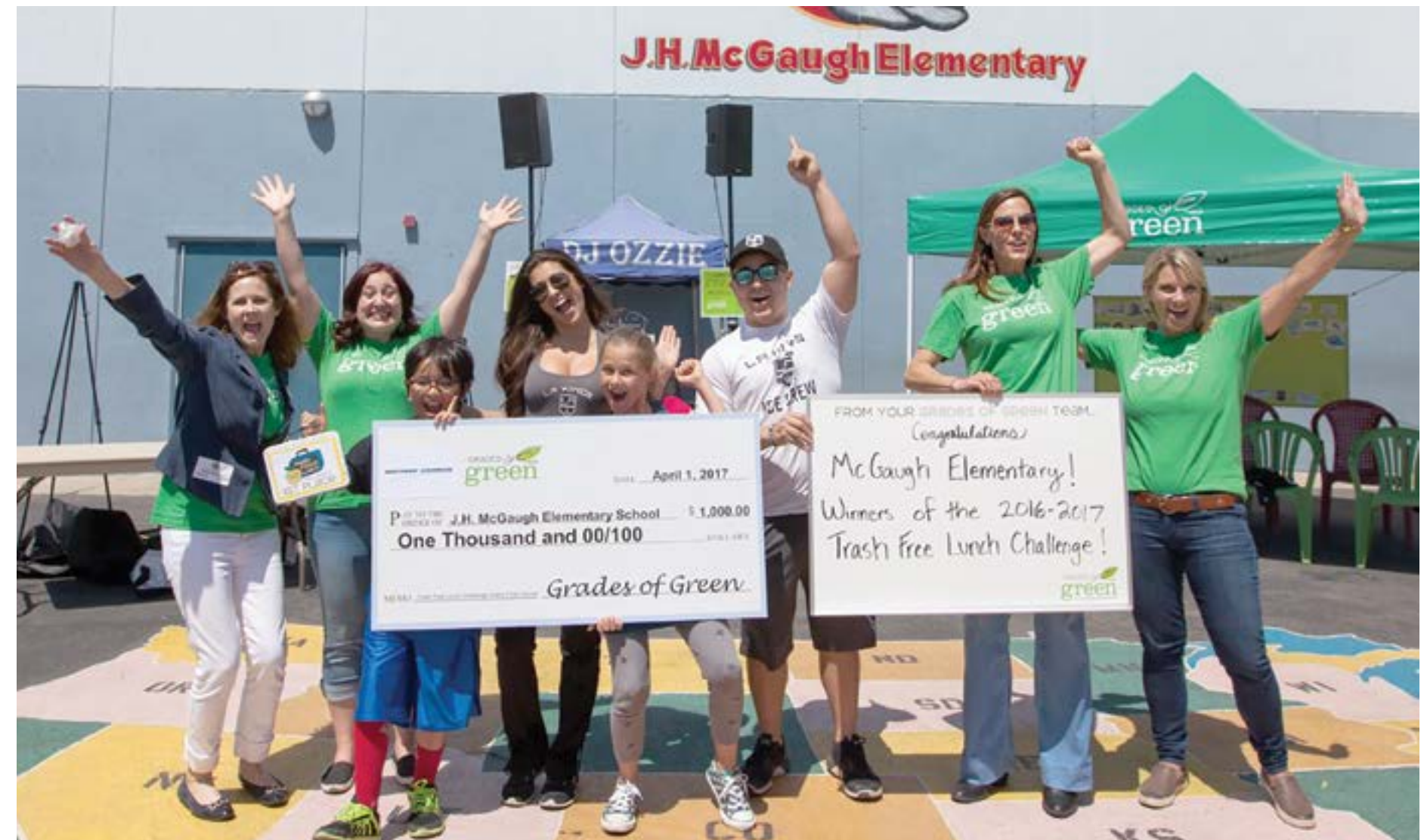
The L.A. Kings Ice Crew was on hand to celebrate with the McGaugh Staff and Students.

McGaugh students learned that one in four children in California is struggling with hunger, and the food rescued from McGaugh will be going to other children in their own community: a local shelter and an after-school program.