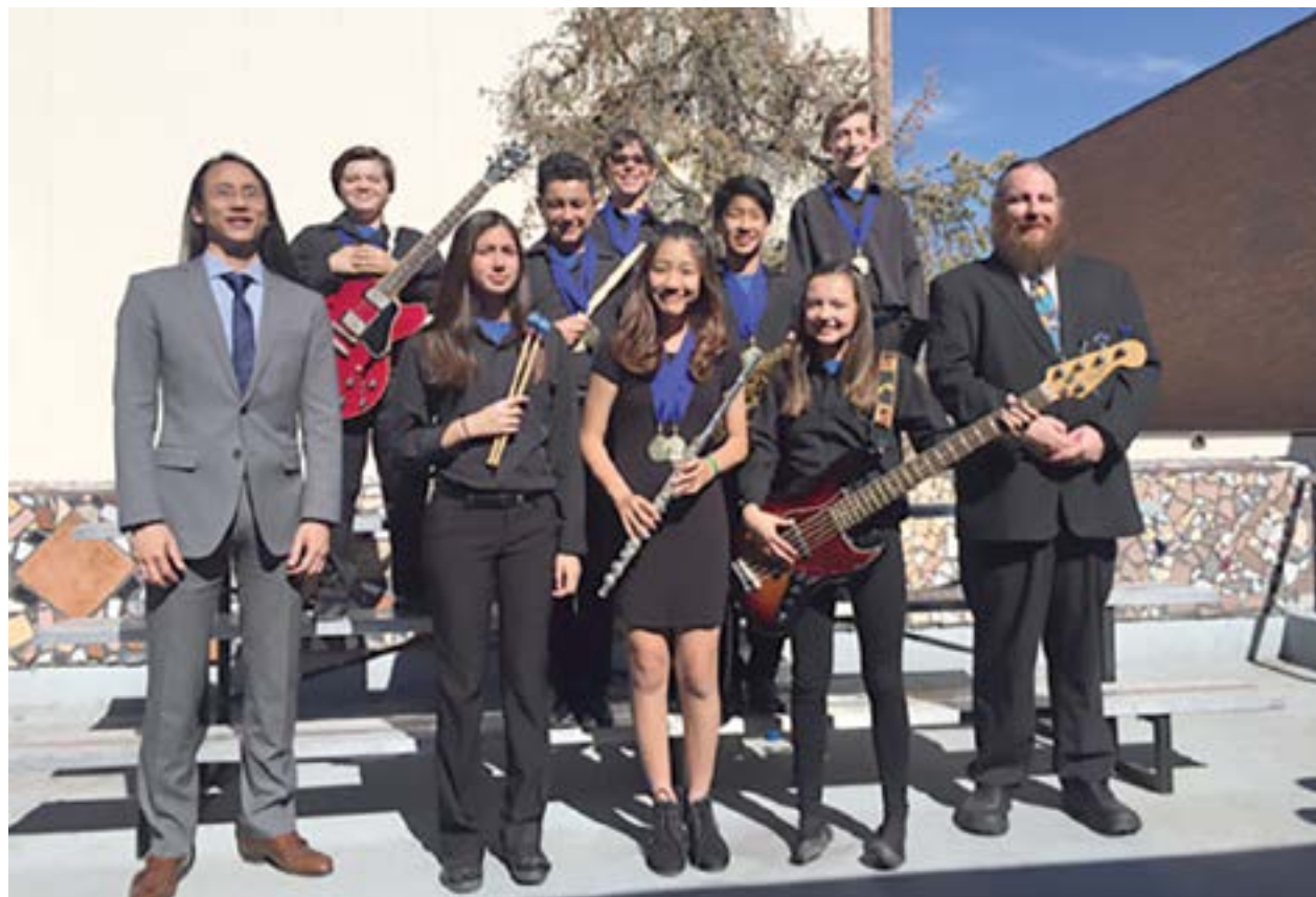
Jazz Band Combo

None of this would be possible without the leadership of our directors, the hard work of our students, and the ongoing and generous support of our parents. Congratulations Jazz Band and Combo for “flying like eagles” in Reno!