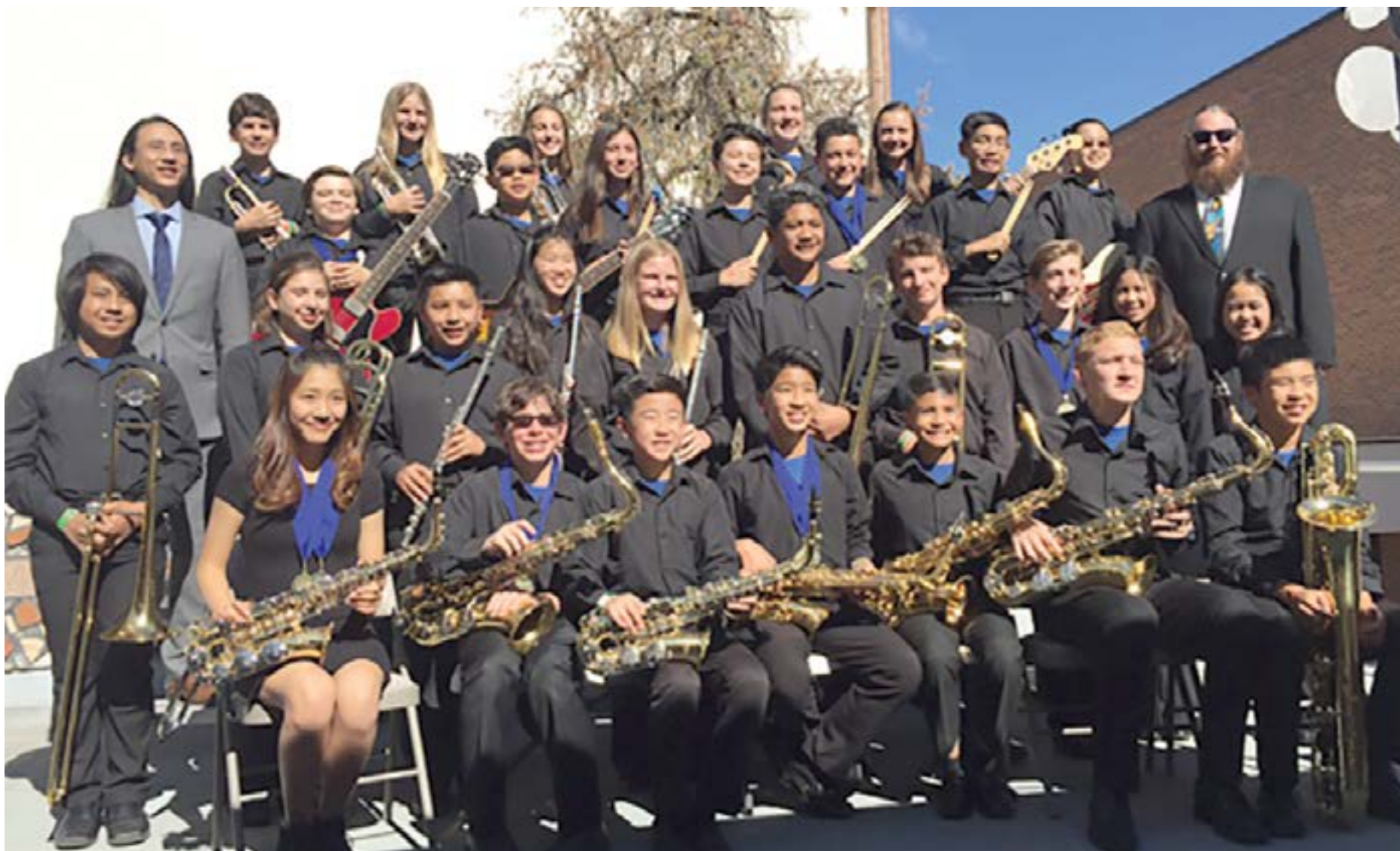
Jazz Band in Reno