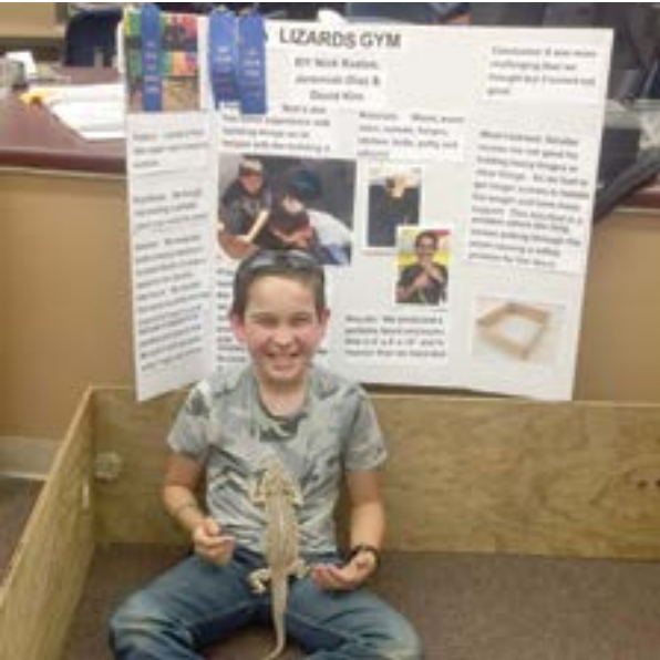
A student shares his Lizards Gym project at Los Alamitos Elementary's STEAM Fair.