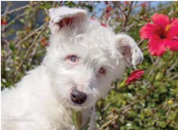
I'm waiting for a forever home!

Some of the dogs have been adopted to forever homes. Others are waiting patiently for that perfect, loving home. Is that your home?