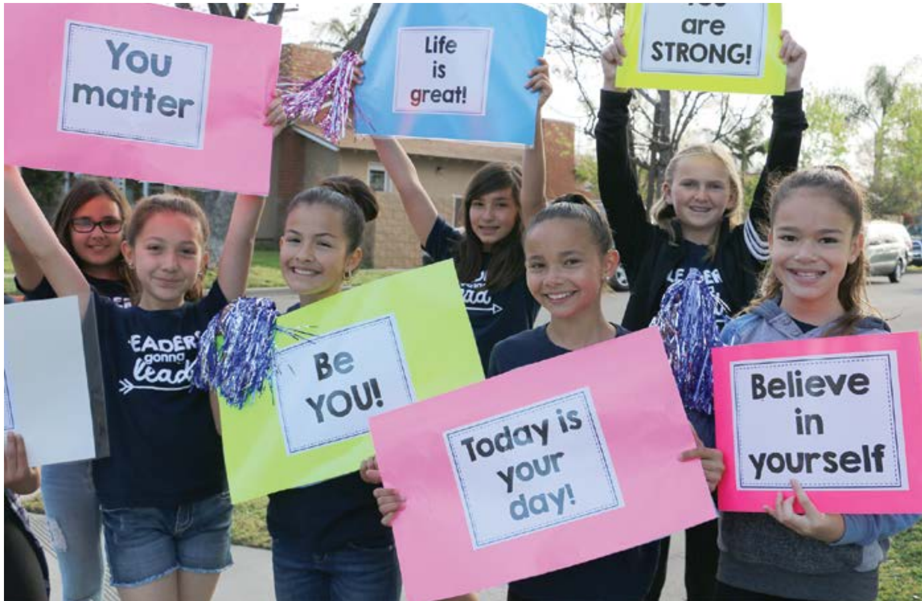
Hopkinson students and teachers welcoming all Huskies with Kindness on a Friday morning

11481 Foster Rd., Los Alamitos, CA 90720 • 562/799-4540 • www.losal.org