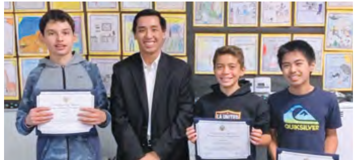
Representative from Congressman Harley Rouda's office presents awards to Congressional App Challenge teams at McAuliffe Middle School