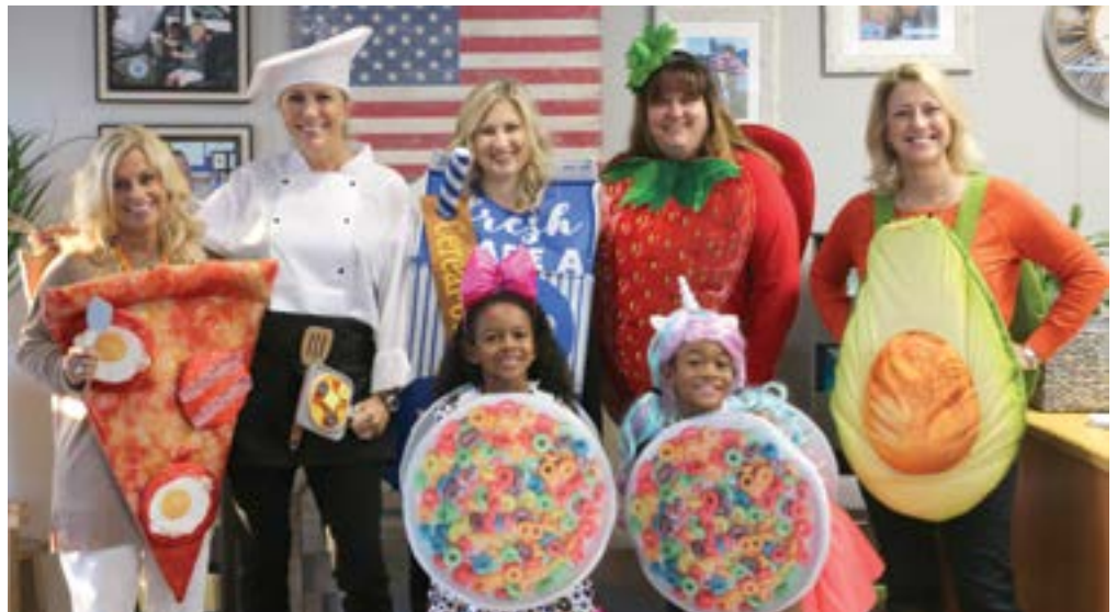
Students were excited to see the administrative team promoting their new breakfast program.

Get your fuel and nutrition first thing in the morning to guarantee a great day of learning at McGaugh.