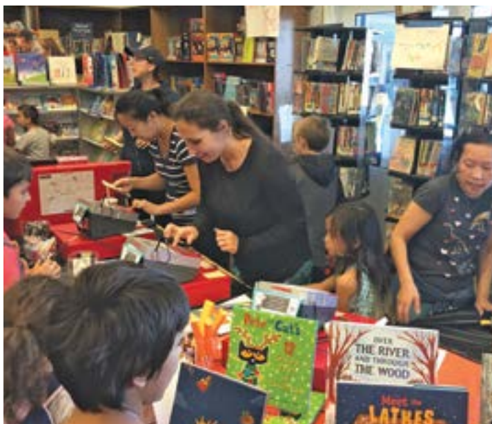
Weaver parents volunteer at the Scholastic Book Fair on Friday, November 9.

The Weaver PTA and Friends of Weaver (FOW), our two main parent organizations, also arrange for field trips, assemblies, art and music education, and STEAM education. These programs extend student learning and