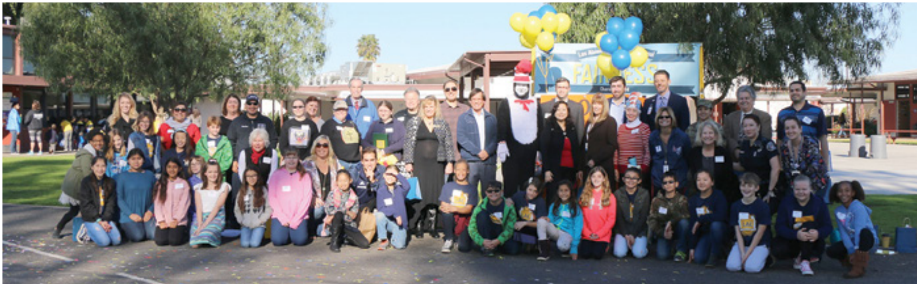
Guest readers, Ambassadors, and the Cat in the Hat at LAE for DEAR Day

The day culminated with family and friends reading picnic-style with students.