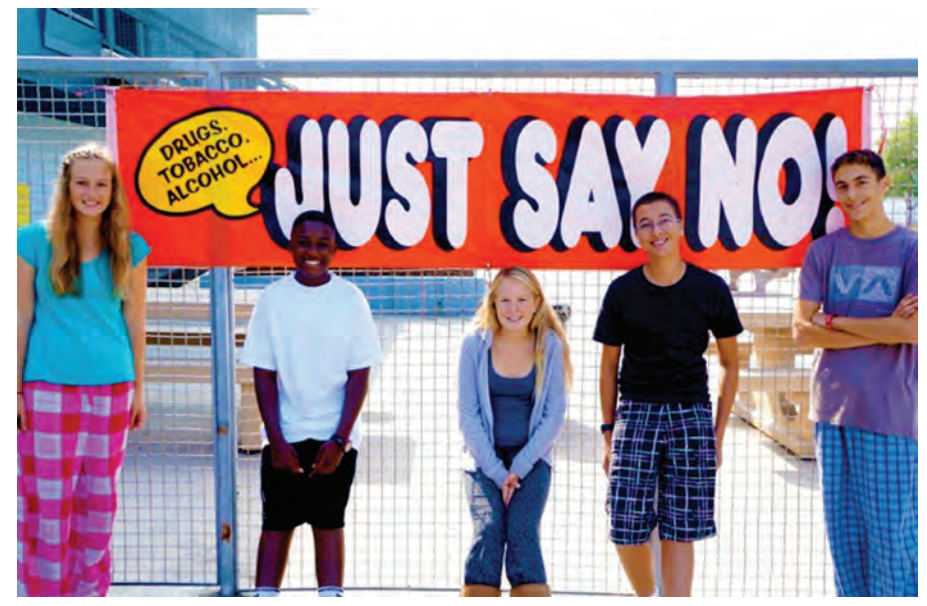
McAuliffe is a special place for our young people to grow and prosper in academics, the arts and athletics. School clubs and activities play a large role in that growth. Thanks to all staff and parents who participate in these important events.