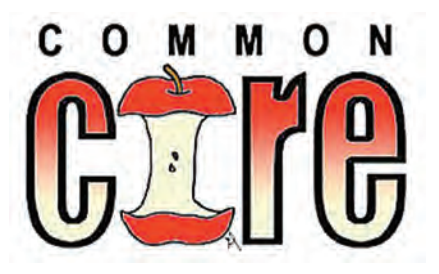
Are you looking for this logo for the contest on page 8?

In addition to the above, we are working on future projects, which include modernization of the District Office and Auxiliary. All of the modernization projects are "On Time and On Budget" and are helping our students and teachers enjoy a 21st Century learning environment as we continue Igniting Unlimited Possibilities for Students. We are grateful for the support of our generous community through the passage of Measure K!