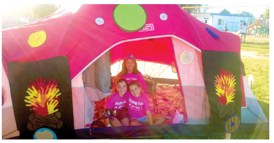
A Rossmoor Brownie Troop enjoys earning a camping merit badge at our Campout Under the Stars.

Our annual campout brings hundreds of people together as a community to help celebrate the end of summer and launch the new school year. When all are asleep, we are even joined by our neighborhood bats and owls who long to join the fun! We hope to see you at the next Rossmoor Campout Under the Stars.