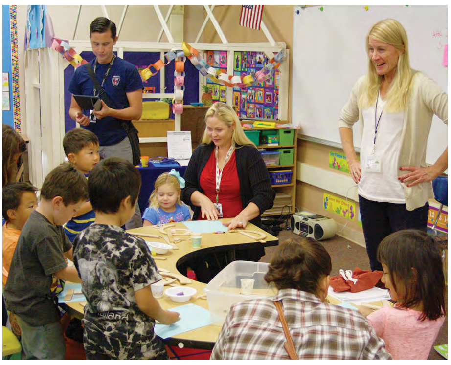
Teacher demonstration lesson with students.

During our student-free staff development day on October 30,