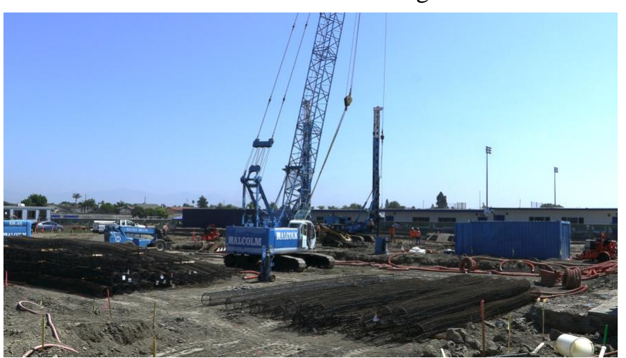
Top, construction of foundations for Aquatics Center. Right, architect rendering of the center. Below, members of Citizens Bond Oversight Committee tour Los Alamitos High construction.

Elsewhere in the District, smaller-scale Measure G projects have also been completed. Rossmoor and Weaver elementary schools have new playgrounds, and another soon will be built at McGaugh Elementary in Seal Beach. New badly needed restroom buildings also are slated for Los Alamitos and Hopkinson elementary schools.