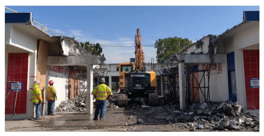
Demolition of the breezeway entrance to Los Alamitos High.

The familiar breezeway entrance to the high school has been demolished in preparation for construction of a three-story classroom building that will provide students with state-ofthe-art science lab facilities and