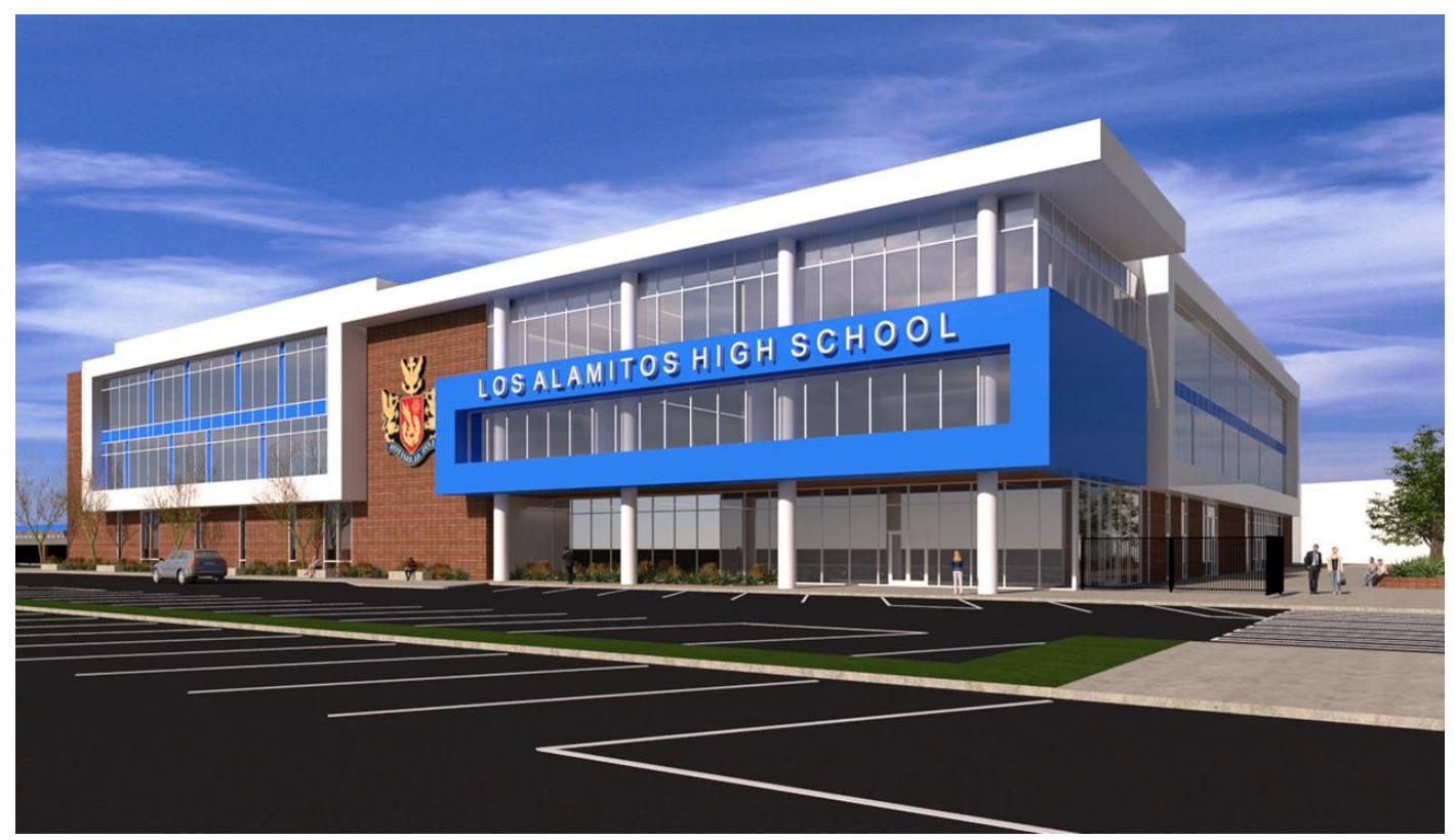
Architect rendering of multistory classroom building set to open in Fall 2022 at Los Alamitos High.