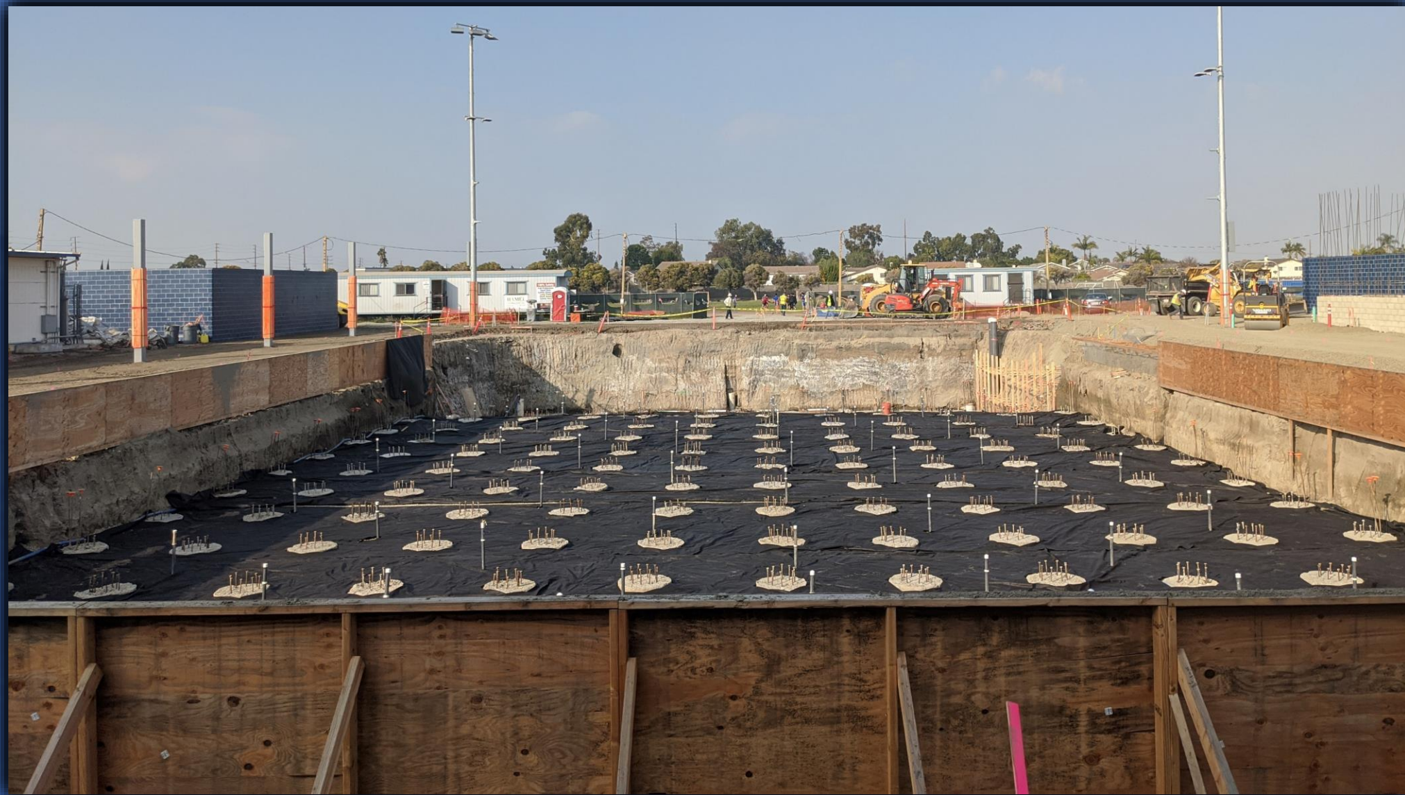
Los Alamitos High School Aquatic Center