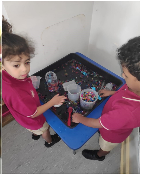
Exploring the water beads in FS2K!