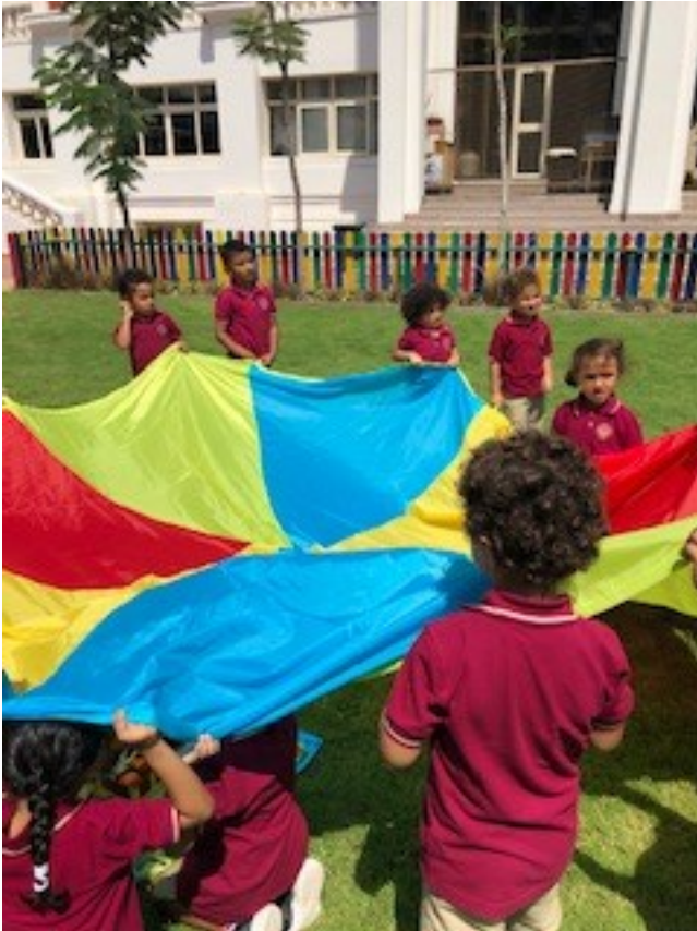
Parachute Phonics Fun in FS2G!

Having fun exploring using the light box in FS2R!