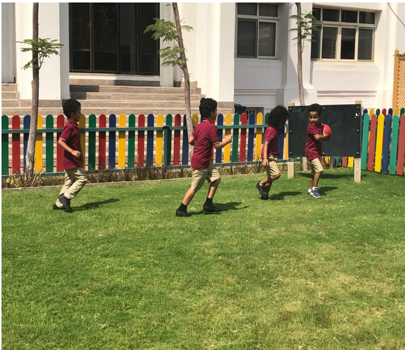
Learning rules and having fun in the garden with new friends in FS2J!