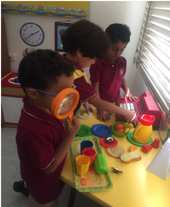
A snack and drink at the FS2C Cafe

Look at all the 'Helping Hands' in FS2S!