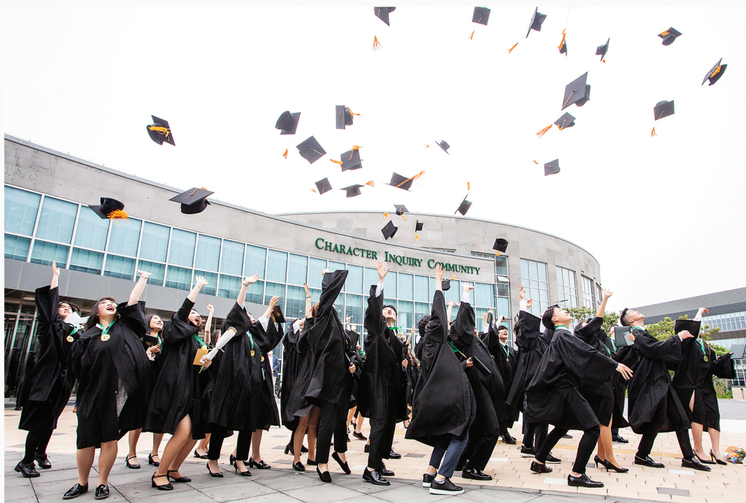
First Graduating Class from St. Johnsberry Academy Jeju 2020

It is with great anticipation and excitement that we celebrate the first graduating class from St. Johnsberry Academy Jeju. Since SJA Jeju opened its doors in October 2017 this group of students has pioneered their way through the first three years of a new school towards the final date of their graduation on May 30, 2020. As the first group of students to enter SJA Jeju and graduate it has been a challenge in many ways. These students have worked diligently in a new school, in a new curriculum, with new friends and teachers, to come to this point in time where they move towards their final weeks of high school education.