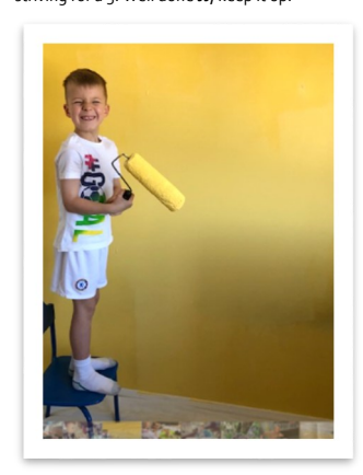
Warblers - Ellis B

For persevering with his home learning. JJ has produced some fantastic pieces of work at home, especially his writing. It is clear to see that JJ is striving for a 5. Well done JJ, keep it up.